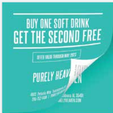
5" x 5"