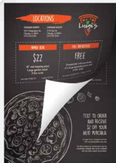
5" x 7"