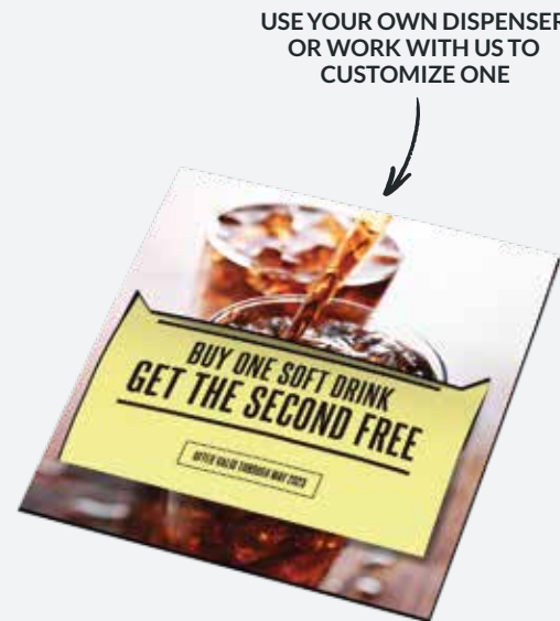
3" x 3"