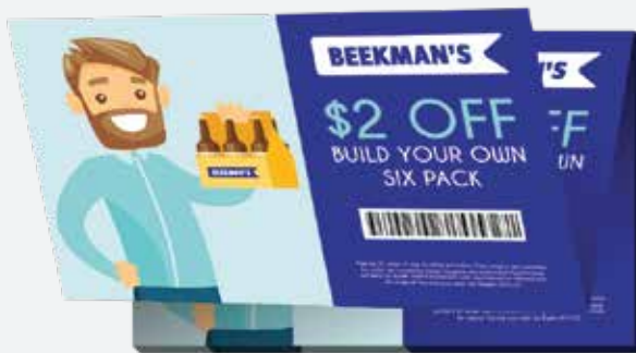
4" x 2.5"

iTSA's z-stack coupons can also serve as a mini billboard for your products. If a shopper is debating which product to purchase, this tiny advertisement — combined with the savings it offers — could make all the difference. They can be affixed at the point of sale just like their grocery counterparts and can be torn off one at a time — getting the word out to as many customers as possible.