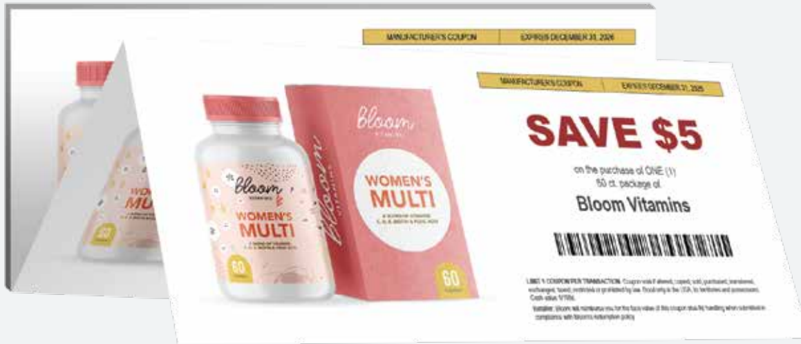
8" x 3.5"