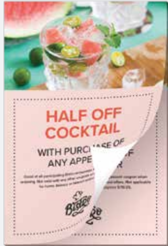
4" x 6"