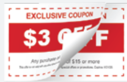
4" x 2.5"

In addition to grocery coupons, iTSA notes can make it so restaurants are able to reach their customers and encourage repeat visits. These inviting and informative coupons can be designed to contain as much detail as desired, and function in much the same manner as the shelf coupons. When a customer is choosing a place to eat or order from, the coupon may be the deciding factor on whether a customer places an order.